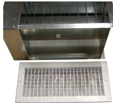
Diffuser back with straightening vanes

CONTROL - The Young Regulator T-720 Proportional and Integral (P+I) thermostats are specifically designed for zoning applications. They control floating point, modulating motors like the Belimo LMB24-3. Accurate temperature control is achieved due to the product's proportional control algorithm. The supply air temperature sensor and primary actuator connections are pre-wired at the factory to an interface board on the diffuser. Field connections consist of the 24v transformer and thermostat wiring to easy to use terminal blocks. For convenience, an extra terminal block is provided for connection to a drone damper. A BACNET communications module is available.